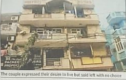
The couple expressed their desire to live but said with no choice